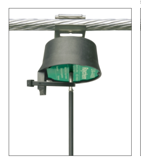
Fault – arrester disconnected from system