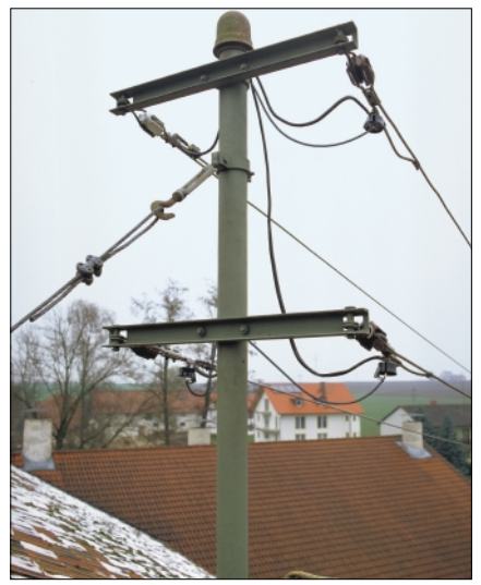
Service entry through overhead system

They are designed for applications in which protection against direct contact is not necessary. Special insulated adapter modules are available for use in insulated overhead-line systems and the lowvoltage bushings of distribution transformers. The integral disconnector disconnects the arrester from the network if an overload occurs, caused, for example, by a lightning strike in the vicinity or an impermissible voltage excursion in the system. If this happens the rating plate on the underside of the arrester dislocates and remains dangling from a holding wire. The ground connection itself remains securely in position.