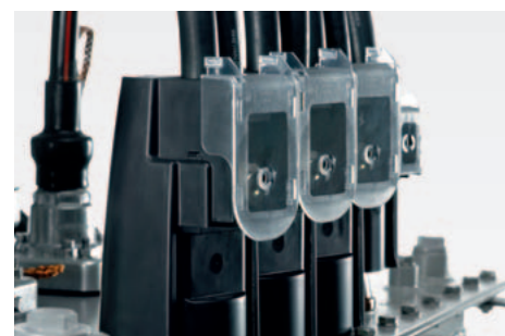
The terminal and cover are also suitable for vertical cable design