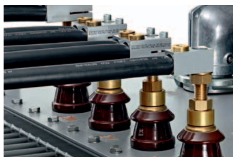
2DIREKT in a single, dual and four conductor version