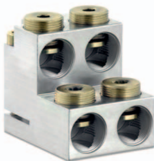
The compact 2DIREKT transformer terminal

In spite of the cover any necessary checks can be carried out easily. For this purpose an opening was integrated into the indoor version of the 2DIREKT cover so that voltage tests can be performed without removing the cover. The cover that is